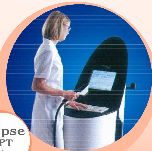
Ellipse PPT System

Vascular Lesions Pigmented Lesions Photo Rejuvenation Acne